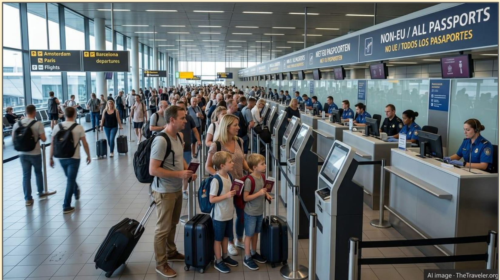
Image used in a story about airport queues