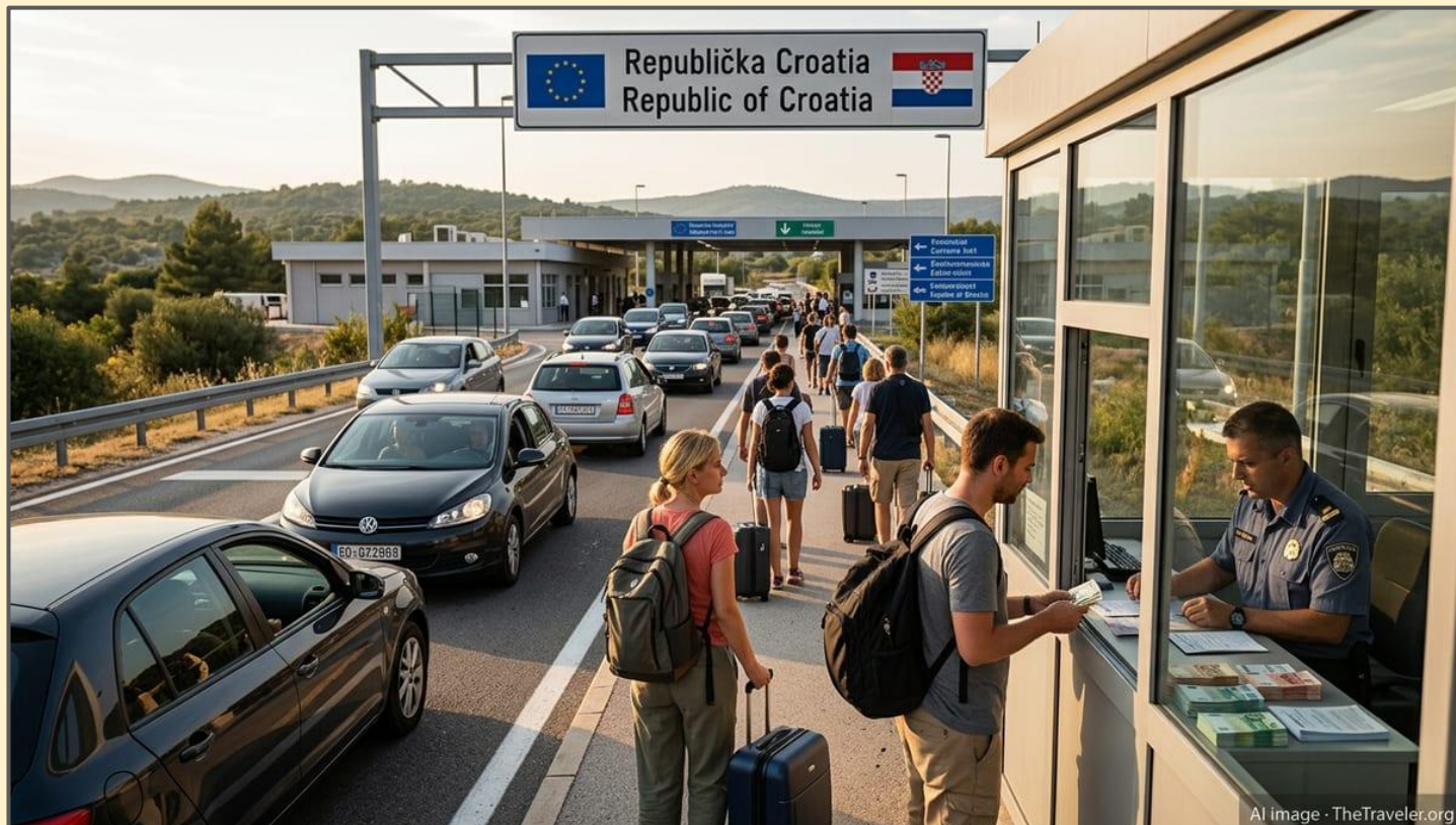
Image used in a news story about EU border crossings