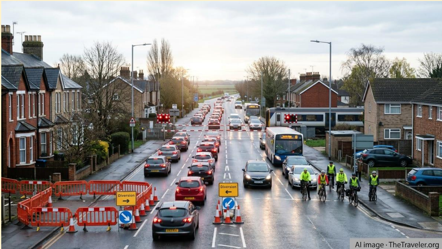
Image used in a traffic in Cambridge